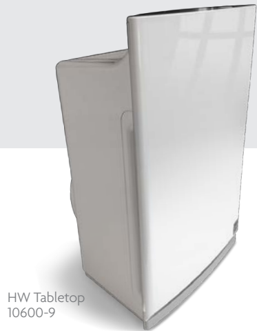
HW Tabletop 10600-9