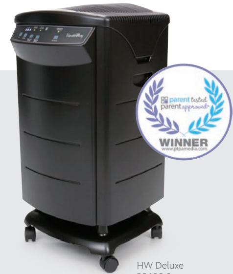
HW Deluxe 20600-3

Both purifiers are easy to operate and maintain, so the changes to your routine will be as microscopic as a dust particle. This results in a cleaner, fresh smelling home, and most importantly, a healthier you.